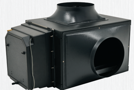
Humidifier integrated with ductable split system shown on evaporator section (also available on ducted systems)