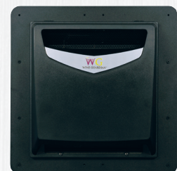
Freestanding (through-wall mounted) humidifier