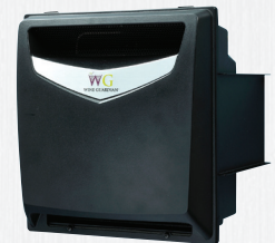
Freestanding (wall-mounted) humidifier